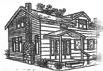
First City Hall Community Museum