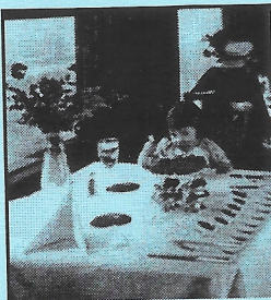
Eating aboard the NPRR was always elegant.