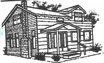
Lacey Community Museum - Dedicated 1980